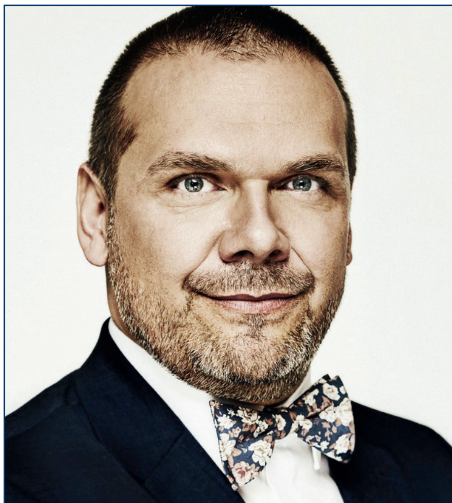
Mgr. Martin Baxa MINISTER OF CULTURE OF THE CZECH REPUBLIC

THE FESTIVAL IS HELD UNDER THE AUSPICES OF: